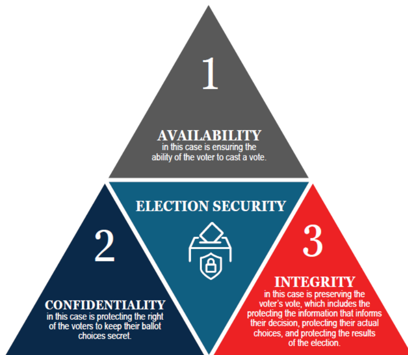
Figure 2: Election Security Factors