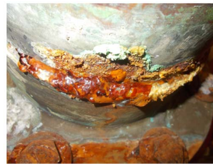
Figure 3 Decaying pipes in Rayburn are at risk of imminent failure.

While the systems in the LHOB are not at imminent risk of failure, they are known to be older, inefficient, and ineffective at maintaining comfort levels. Air handling units are original to the building. Masonry on the external façade is in decay. Windows are single pane and in poor