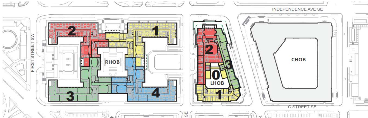
Figure 6. "Longworth courtyard infill option"

Assuming that preparations will be complete to allow start of construction in 2030, the project would be completed in 2046 (17 years). Figure 7 lists the number of Committee hearing rooms and Member suites that would have to be relocated to swing space during each phase.