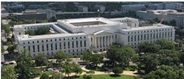
Figure 2. The Rayburn and Longworth House Office Buildings

The Rayburn House Office Building (RHOB) was completed in 1965. It contains 2.4 million gross square feet (GSF) divided among 10 levels, including three parking levels and a sub-basement which are partially below grade. The RHOB has 168 Member suites and 30 Committee hearing rooms.