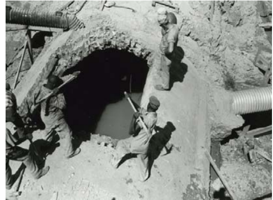
Figure 4. Construction of Rayburn in 1957 broke into the Tiber Creek sewer near C Street