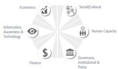
Figure 1: “Constraints that Make it Harder to Plan and Implement Adaptation:”

Note: The figure is from the Technical Summary of the Climate Change 2022: Impacts, Adaptation and Vulnerability. Working Group II Contribution to the IPCC Sixth Assessment Report (Pörtner et al., 2022, p. 78).