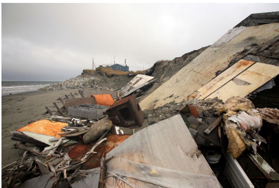
Houses collapsed due to coastal erosion in Shishmaref, Alaska, US.

Managed retreats are costly and disruptive to communities and individuals. It requires extensive, time-consuming study.