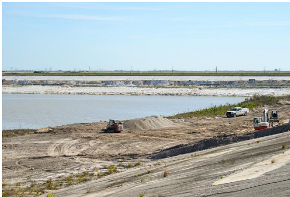
Palm Beach and Broward counties are constructing the C-51 Reservoir on 2,200 acres in South Florida. Source

Local public utilities and private sector entities are working to construct a $161 million stormwater and water supply reservoir, expected to meet Palm Beach and Broward County water demand for 50 years. Phase I was completed in March 2024 . The Southeast Florida Regional Climate Change Compact served as a platform for creating the public-private partnership. The compact was created in 2009 in recognition of heightened risks due to low land elevations, rising sea level projections, and anticipated increases in tropical storm events. The region includes 6.2 million people, 109 municipalities, and two Tribal governments.