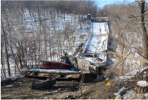
Pittsburgh's Fern Hollow Bridge Collapse on Jan 28, 2022.

In 2023, the American Road & Transportation Builders Association reviewed the U.S. DOT's National Bridge Inventory, finding that "36 percent of all U.S. bridges (621,510) require major repair work or replacement." Almost 7 percent, or 42,391, of those bridges are considered structurally deficient. That number has decreased by roughly 600 since 2022, but it would take 75 years to address them all at the current repair rate.