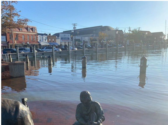
The Annapolis City Dock, located in the historic downtown, often floods during storm events.

“Horizontal” partnerships may be managed by a non-profit organization or a special-purpose government entity, such as a special district, joint-powers authority, or quasi-governmental entity. At least two states (Maryland and California) have authorized such partnerships to address climate change.