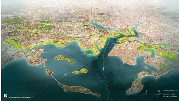
Aerial view of Boston Harbor, where water and wastewater improvements are underway.

As borrowers repay their loans, the principal and interest payments are returned to the revolving fund, replenishing its capital base and making funds available for future loans. This revolving structure allows the fund to recycle its resources continuously, maximizing the impact of the initial investment and supporting a steady stream of climate-related projects in communities across the country.